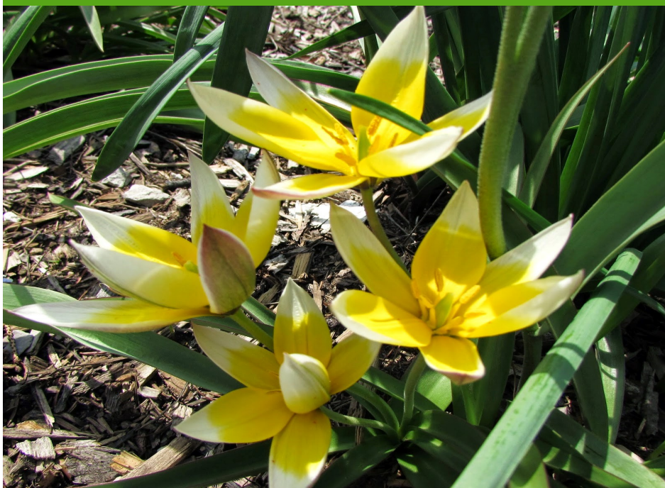
HAPPY SPRING !